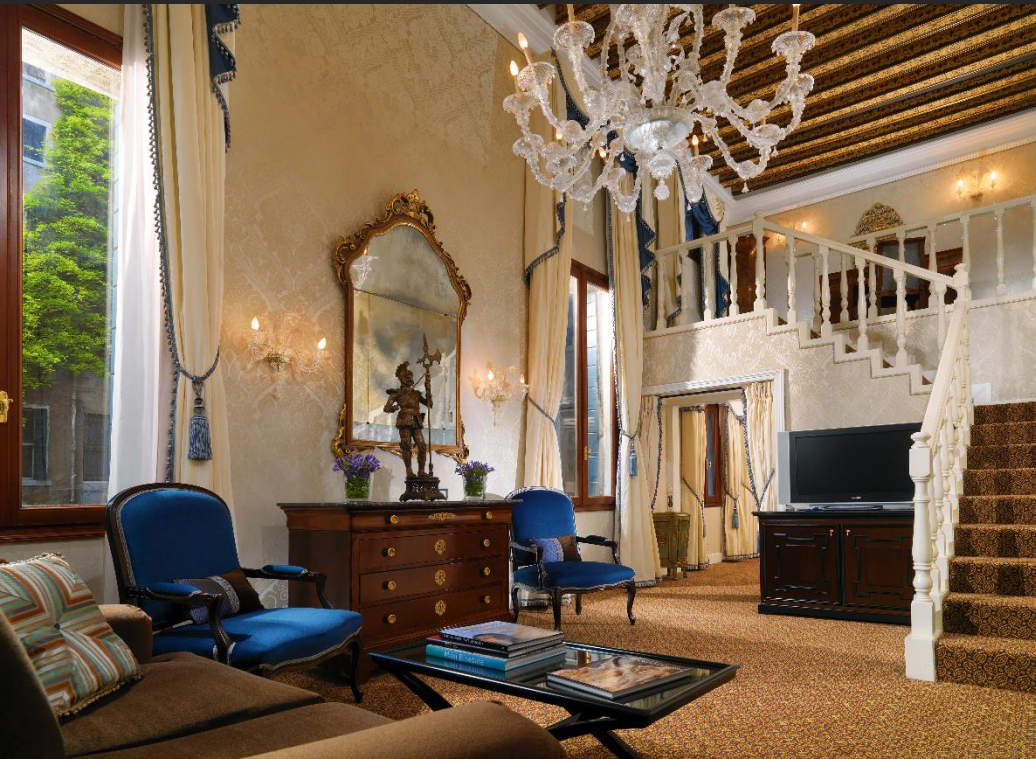
Milan Deluxe Suite - guestroom