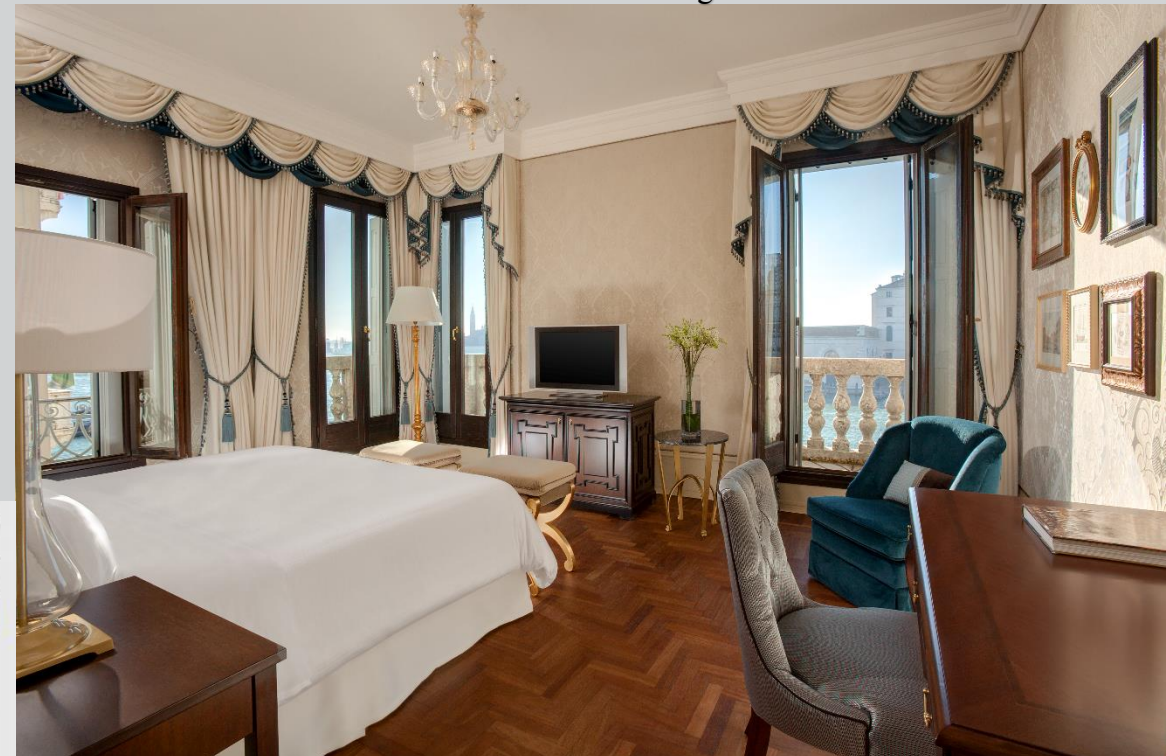
Milan Deluxe Suite - living room