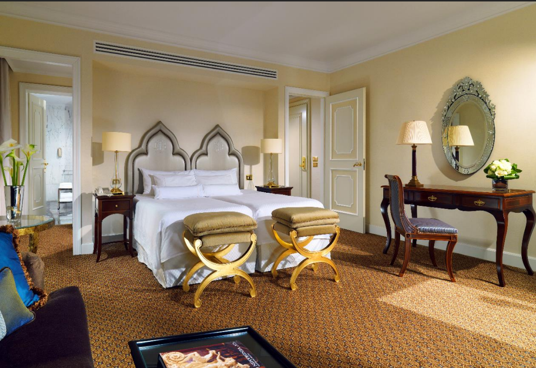
Premium Deluxe Double Guestroom