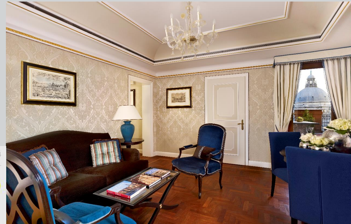
Deluxe Terrace Suite - living

Starwood has several hotels in Venice; this one is a good value and well worth considering. *